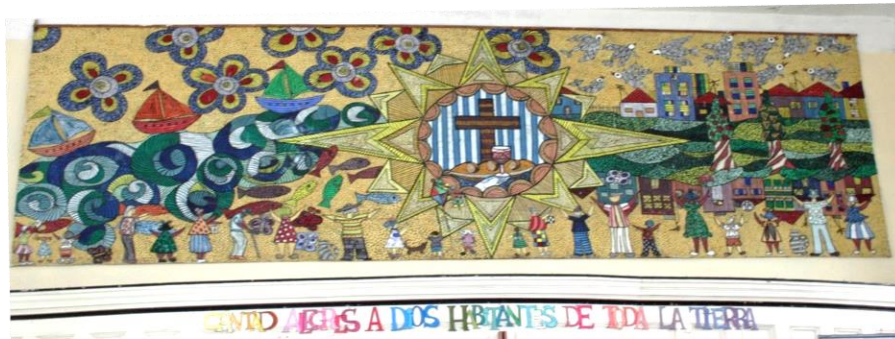
of a mosaic in First Baptist Church in Matanzas, Cuba.

First Baptist Church partners with Canadian Baptist Ministries (CBM), a global mission organization committed to sharing the God's love in word and deed. CBM, in turn, collaborates with field staff and national churches around the world.